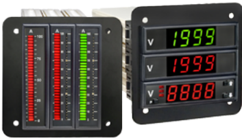
Switch Board Panel Cutout Adapter Plate (p/n:OP-PMA/SWBD)

Alternative 3 phases Digital Indicators and Controllers. See flyer (Z667)